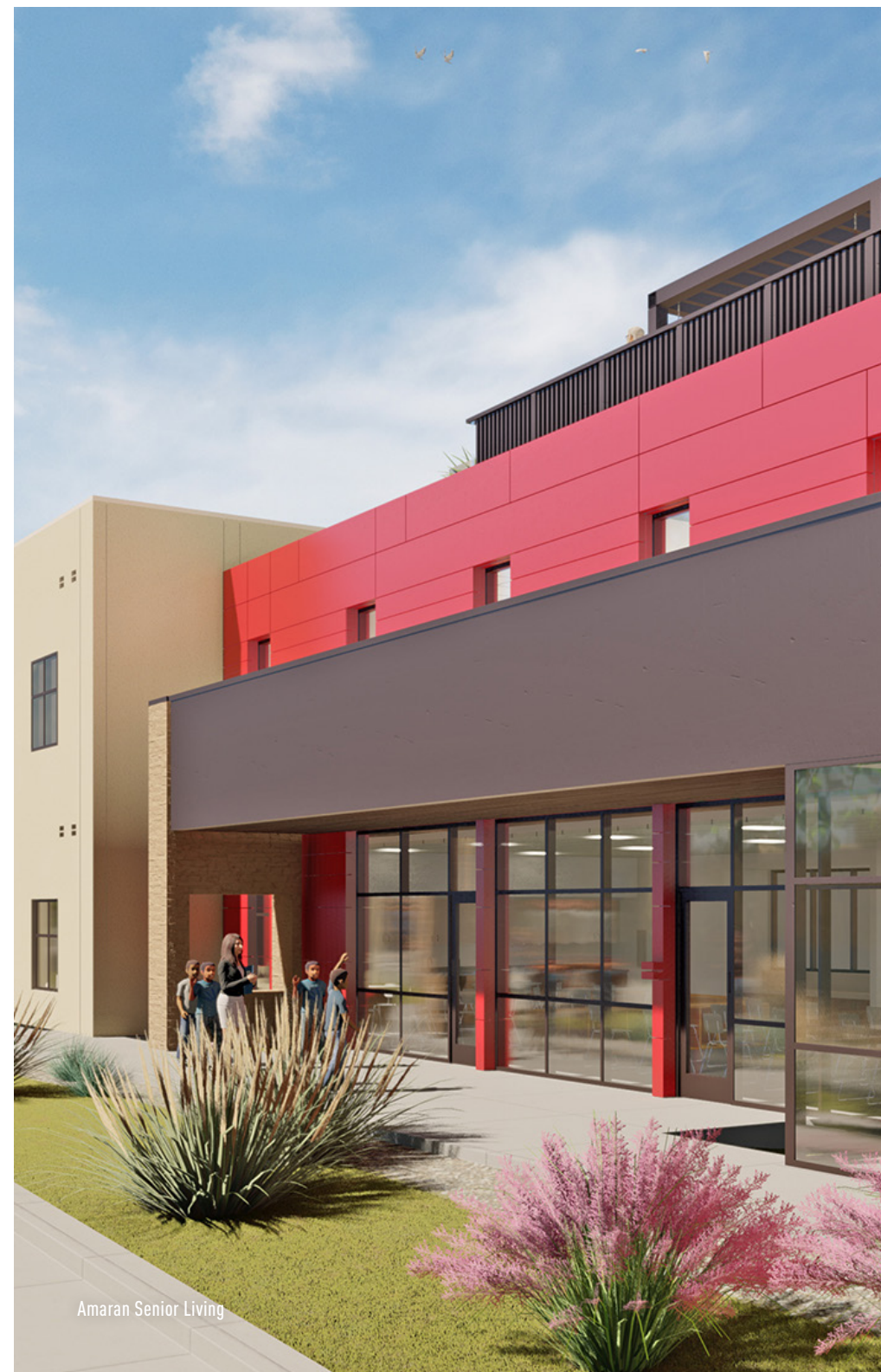
Amaran Senior Living