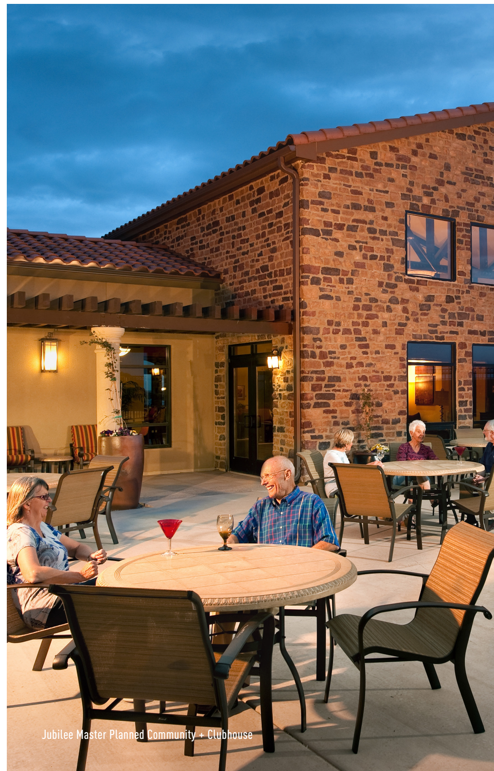
Jubilee Master Planned Community + Clubhouse