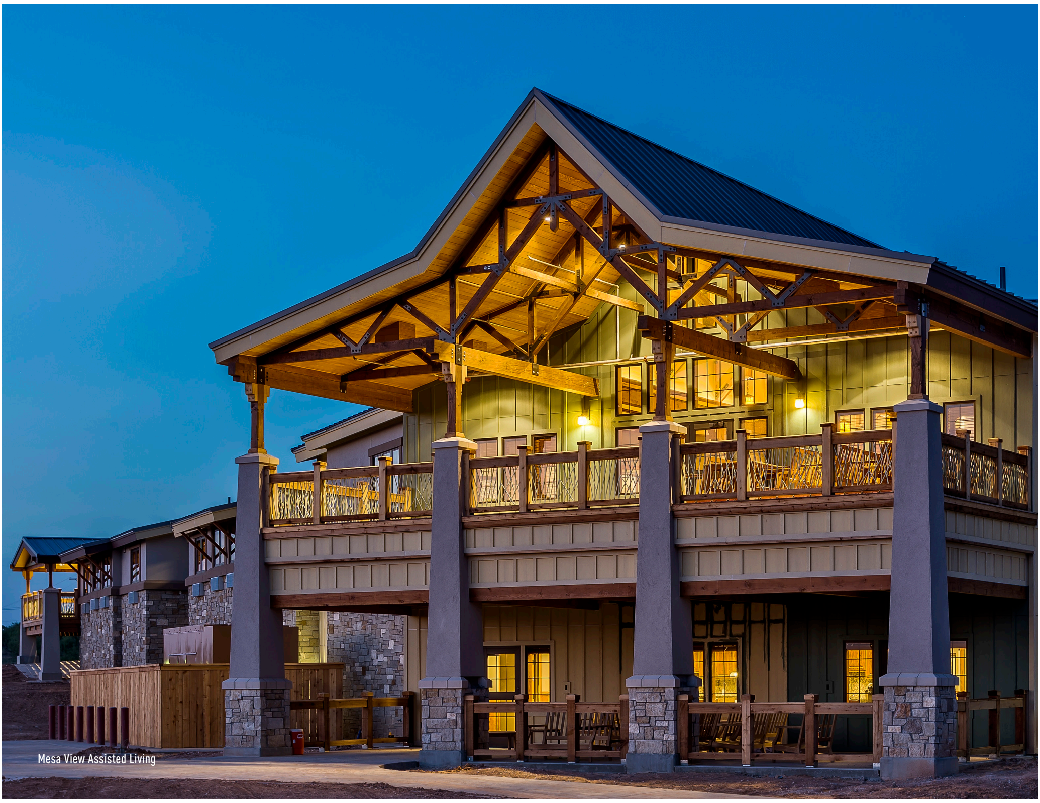
Mesa View Assisted Living