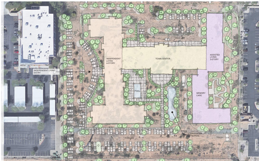
Whispering Winds Site Concept - Phoenix, AZ